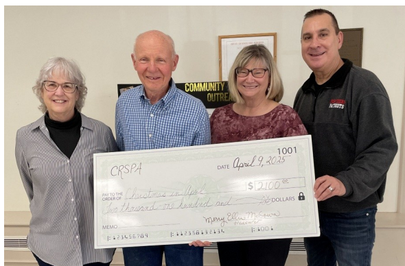
CRSPA Community Outreach Presentation