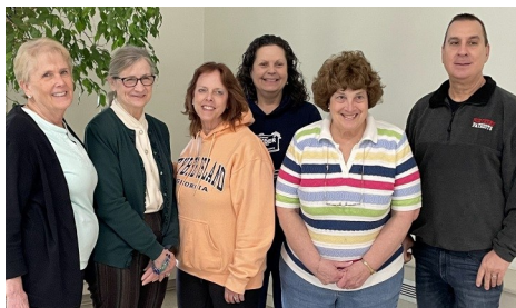
CRSPA Officers 2025-2026