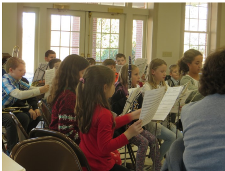
Mutual Elementary Advanced Band and Strings.